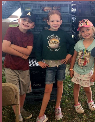
Future Cornfest leaders.